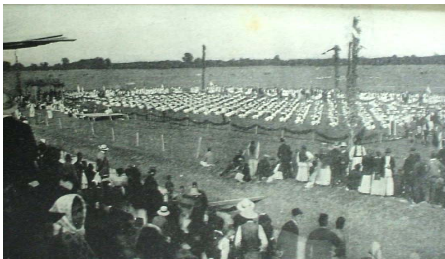
Photography 5. The Sokol-pobratim slet held on Vidovdan 1911 57

The Sokol club from Prijedor held a bee-party with public training and a dance party on the day after Christmas, on 8 th January 1910. The representatives of several neighbouring clubs, likewise the club from Banja Luka, took part in it. 55 For the reasons of being so close to Banja Luka (56 km) and having a developed club at that time, Prijedor often organized various social events; it is reasonable to assume that the Sokols from Banja Luka took part in them. The members of the Sokols from Banja Luka, Prijedor and the nearby villages attended the sanctification of the common hall for the Sokol club and the Serbian Singing Club "Fairy" ("Vila") held in Prijedor on 12 th August 1912. There was a public training accompanied by a band of tambura-players (a kind of stringed instrument). A concert was staged in the "Prijedor" hotel that same night. 56