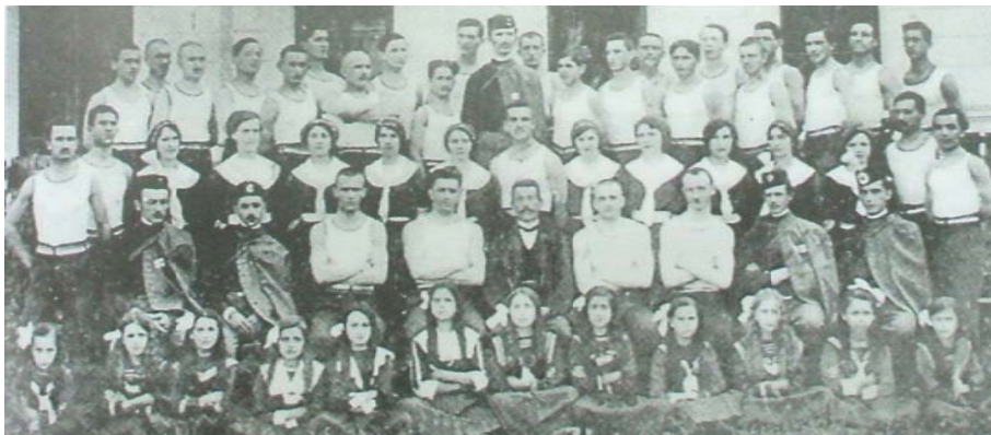
Photography 4. "The Serbian Soko" preparing for Vidovdanski slet in 1914 51

After the slet had been finished, the conclusion was that similar events should be organized every year and the Sokol clubs from all over Bosnia and Herzegovina should be included. This was the reason for the meeting of the Sokols held in Banja Luka on 7 th April the following year. The issue of the meeting was the arrangements around slet in the Frontier, in the city on the Vrbas River, although we don't have any data that this particular slet was ever realized. 50